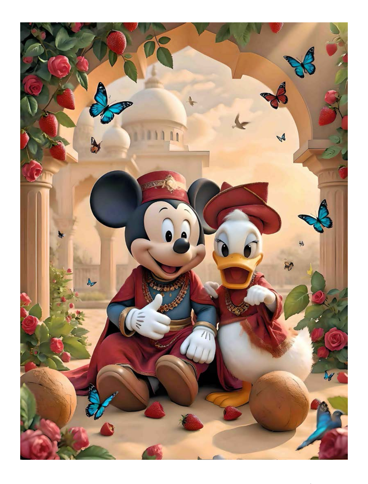
Mick & Duck Decolonised, Archival Ink on Canvas, W20" x H28", 1 A/P + Edition of 3