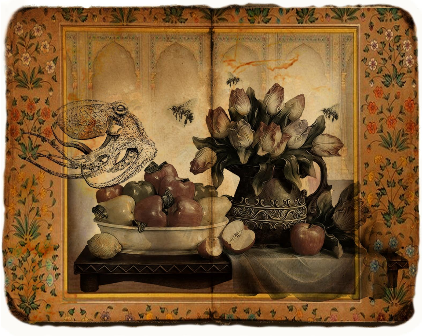
Unwanted Guests | Mixed Medium with printmaking | 14 x 11 Inches