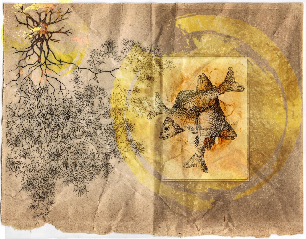
Three Is A Charm | Mixed Medium with printmaking | 30 x 23 Inches