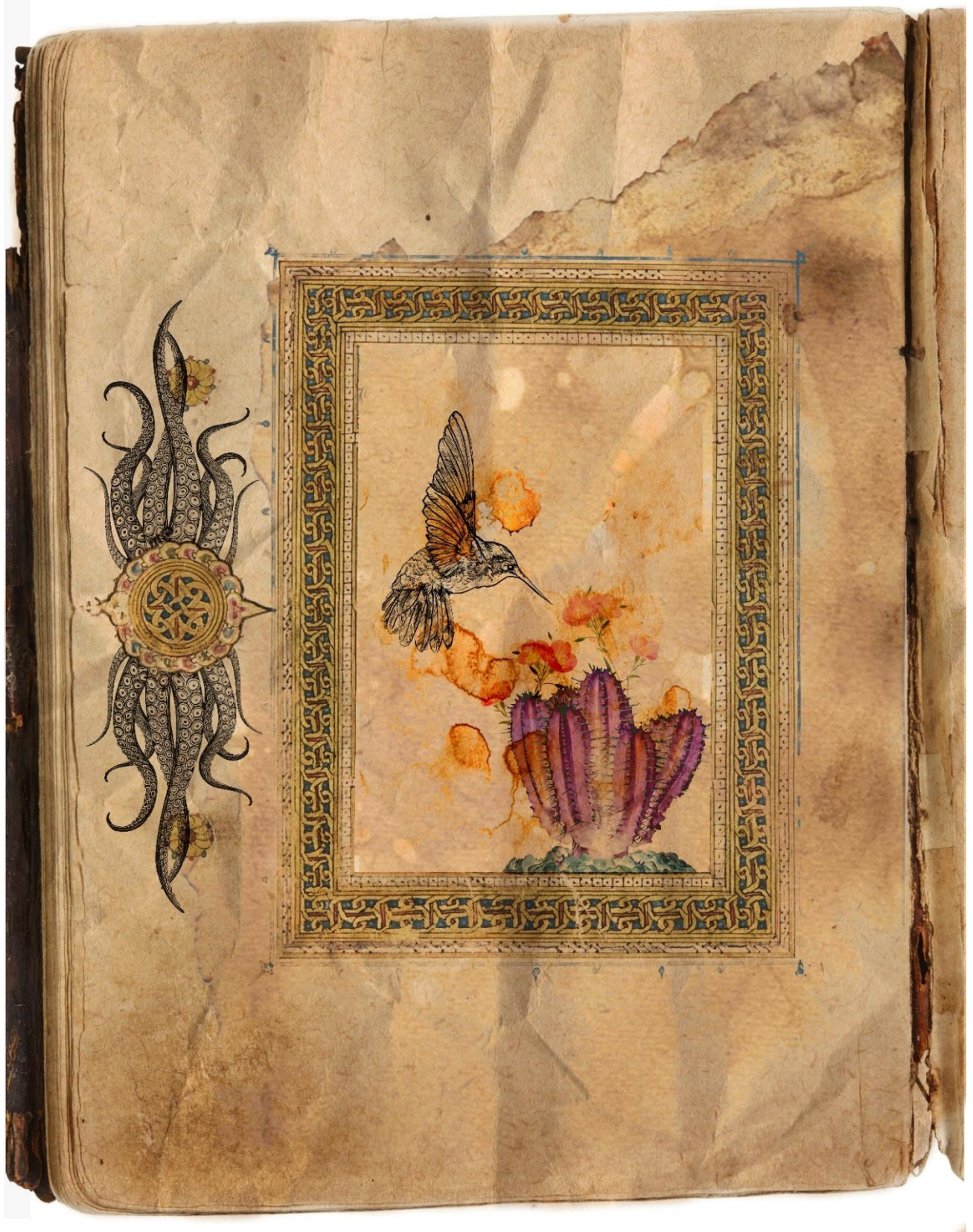
A New Message | Mixed Medium with printmaking | 10 x 12 Inches