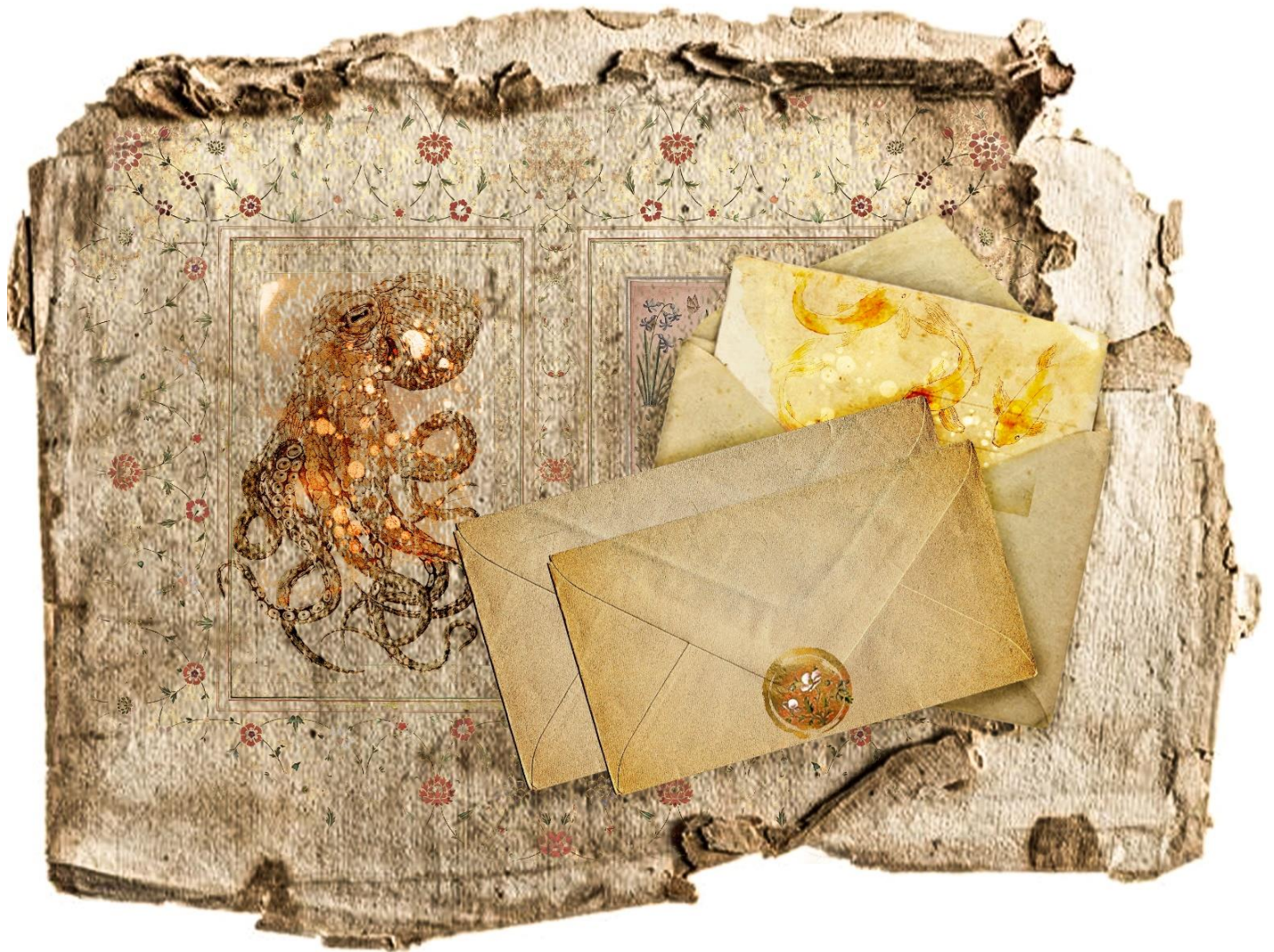
Still in Close | Mixed Medium with printmaking | 20 x 15 Inches