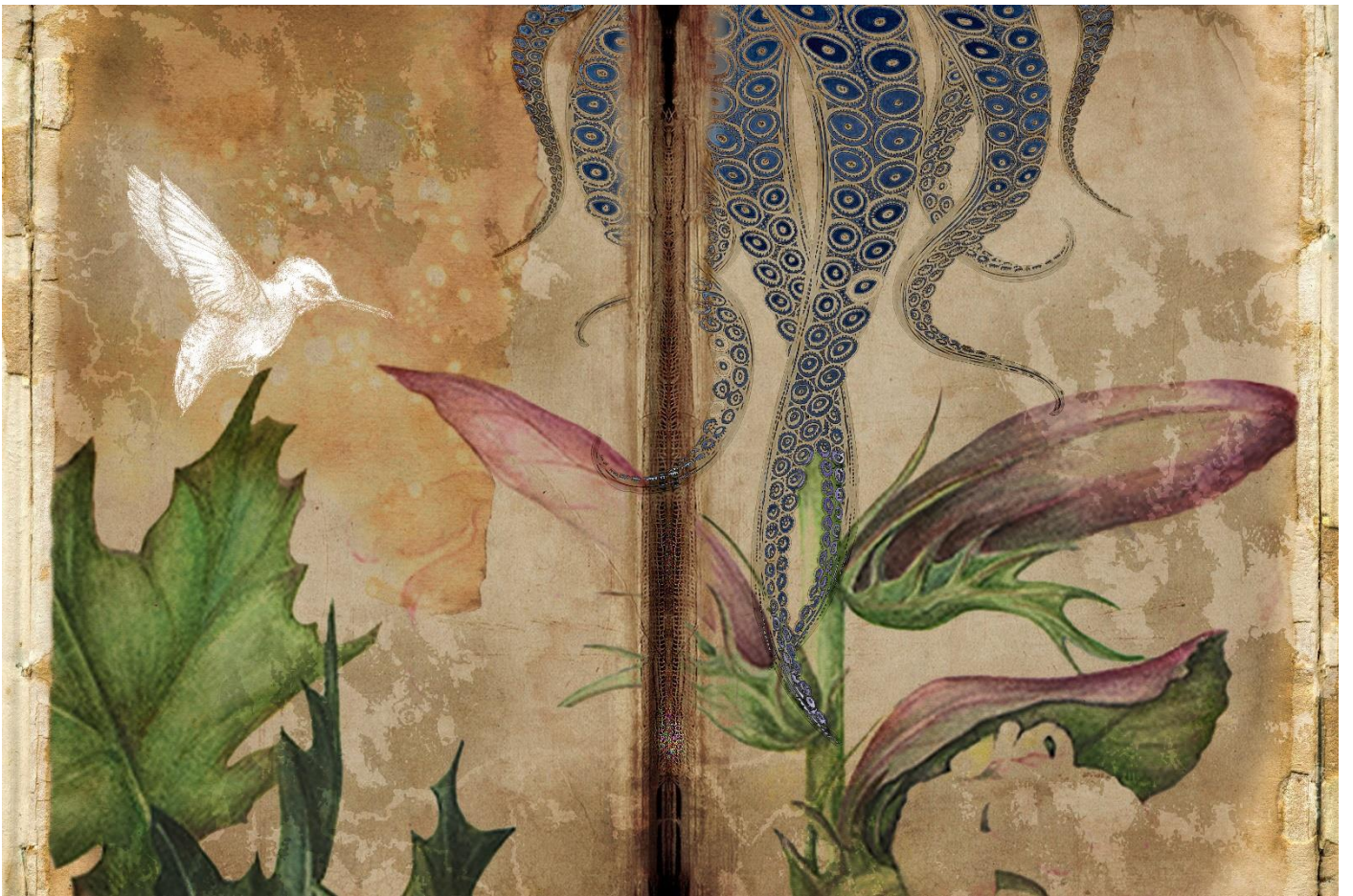
New Emergence | Mixed Medium with printmaking | 35 x 24 Inches