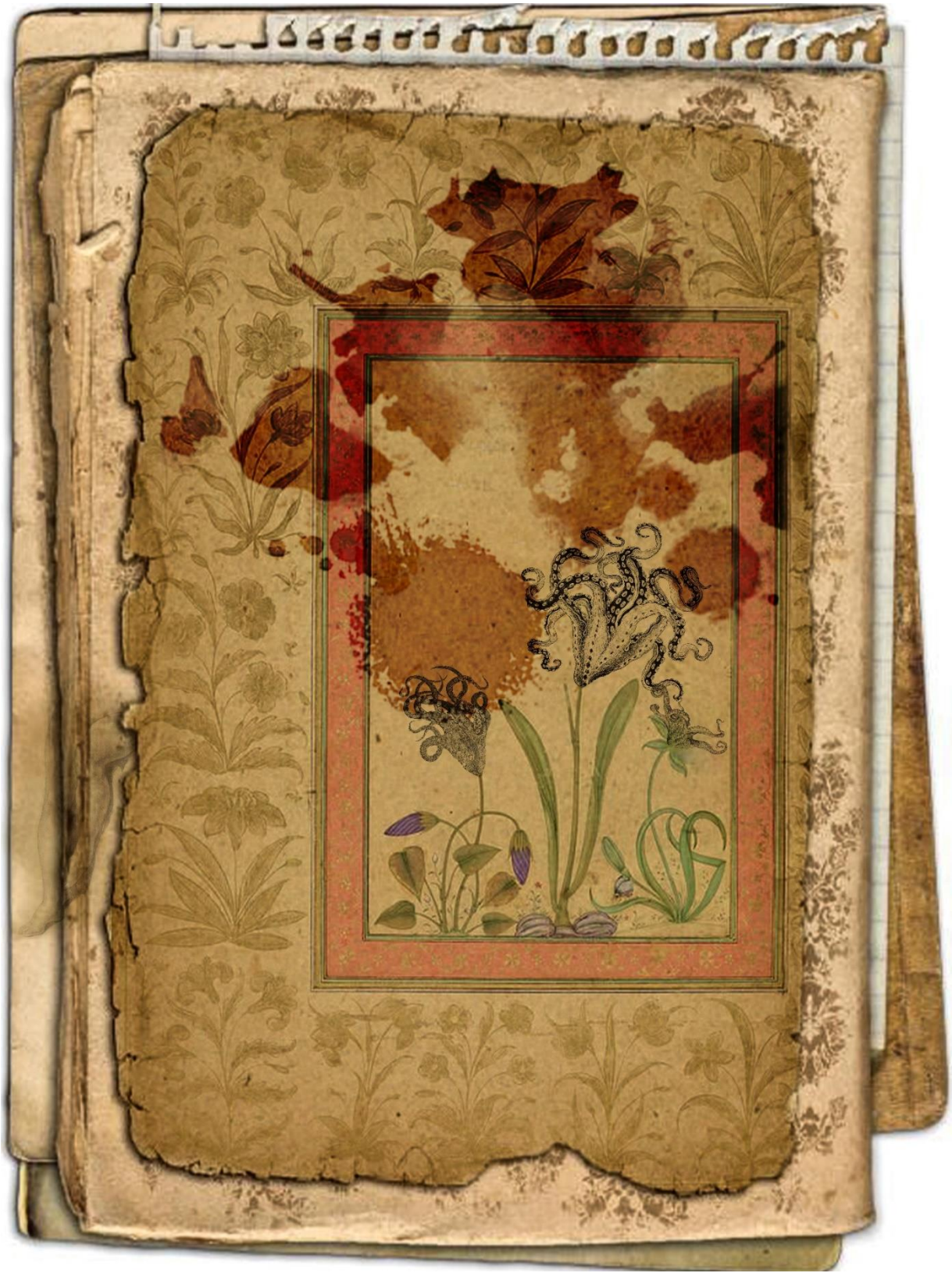
Difference That We Made | Mixed Medium with printmaking | 24 x 17 Inches