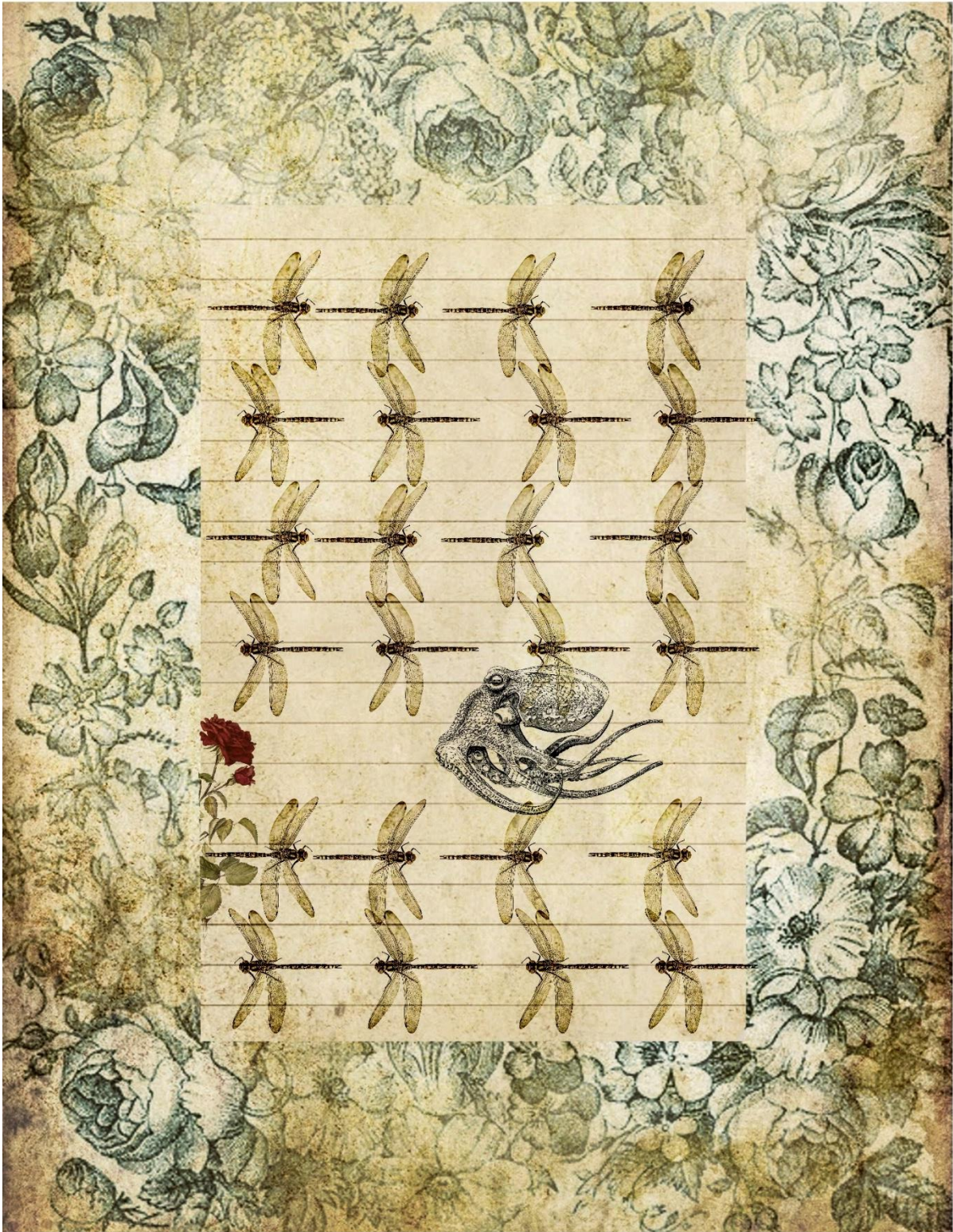
Breaking Monotony | Mixed Medium with printmaking | 10 x 8 Inches