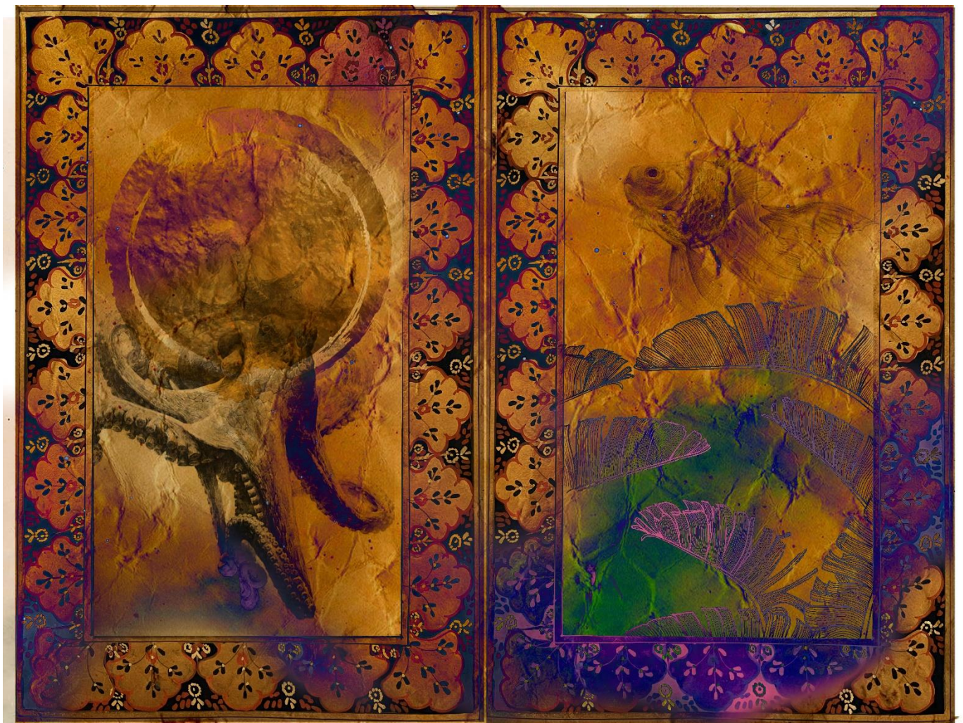
Two Chapters | Mixed Medium with printmaking | 20 x 15 Inches