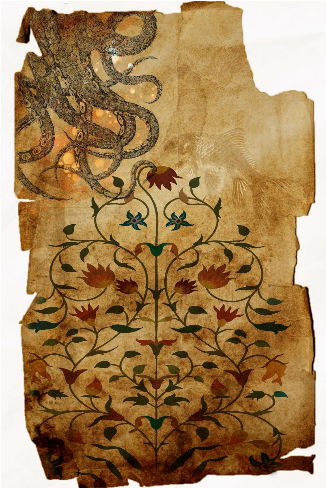
Untitled | Mixed Medium with printmaking | 13 x 7 Inches