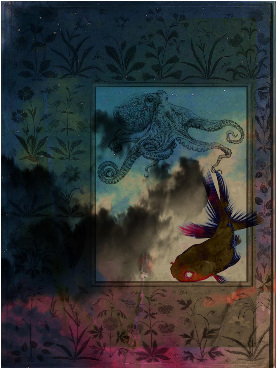
Can We Be Fireflies | Mixed Medium with printmaking | 10 x 7 Inches