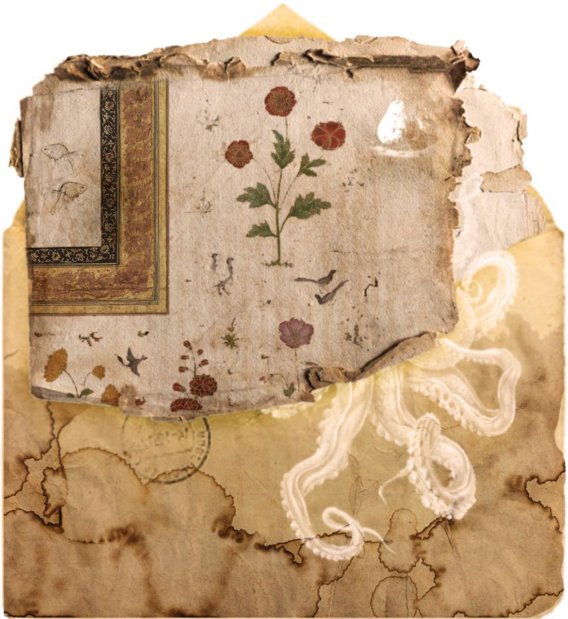
Overlapping | Mixed Medium with printmaking | 14 x 15 Inches