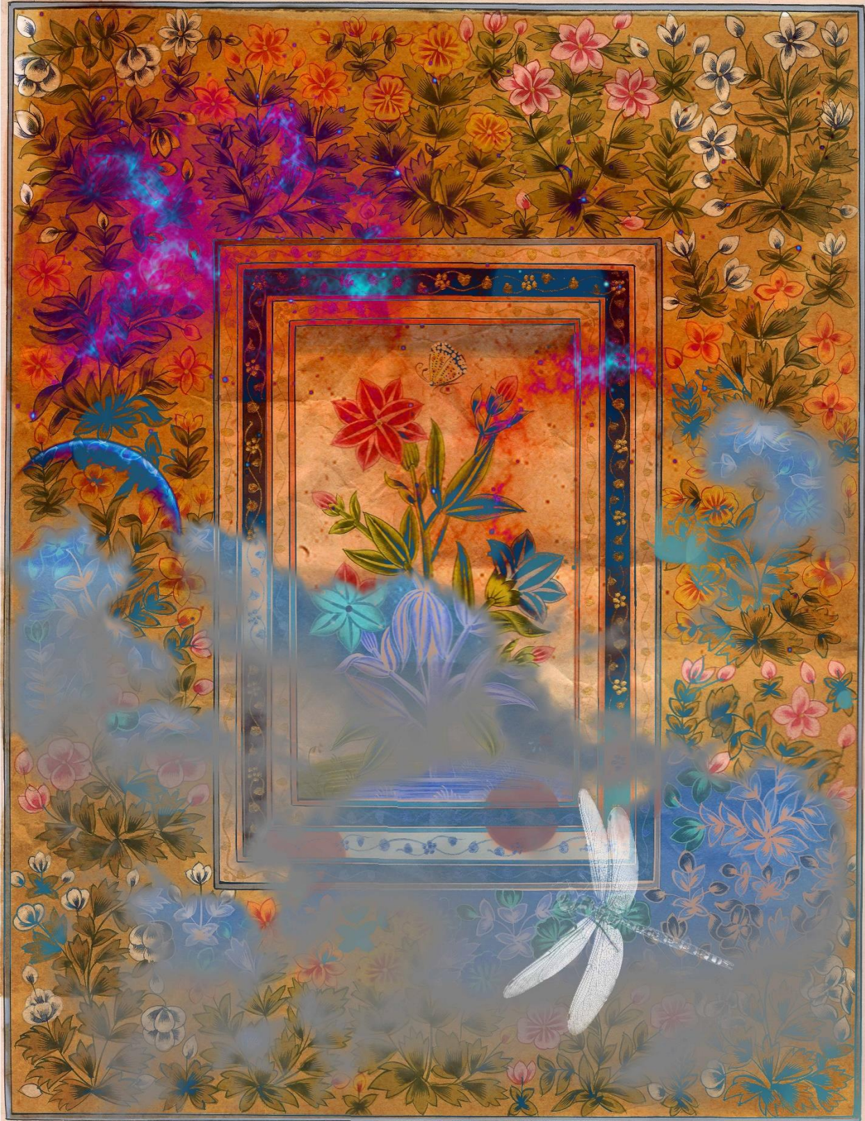
New Beginning | Mixed Medium with printmaking | 17 x 13 Inches