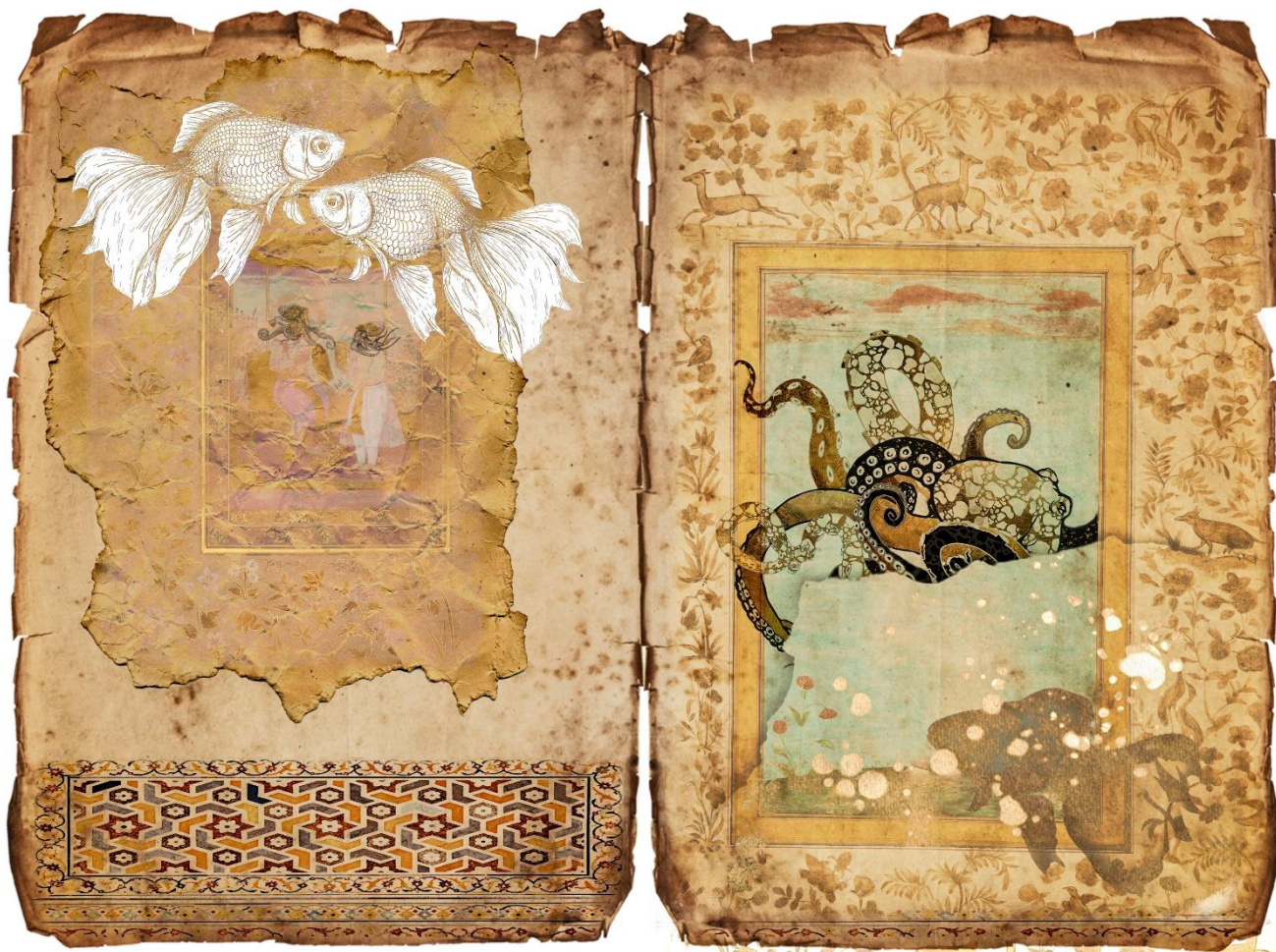
Isolated Yet Talked About | Mixed Medium with printmaking | 35.5 x 26 Inches