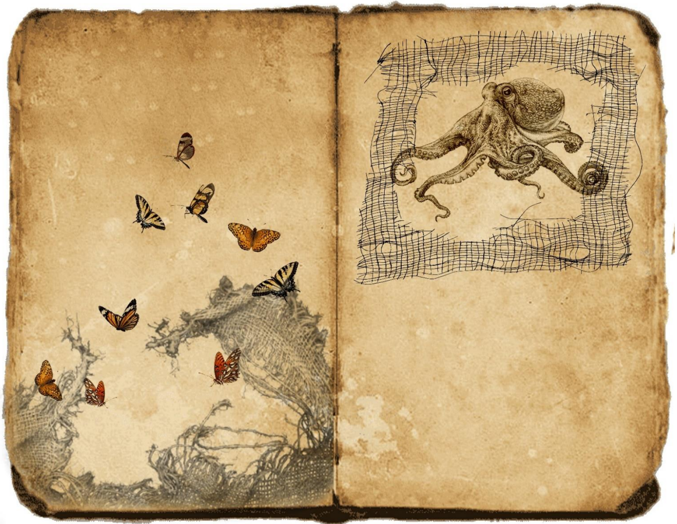
In Trap | Mixed Medium with printmaking | 11 x 8 Inches