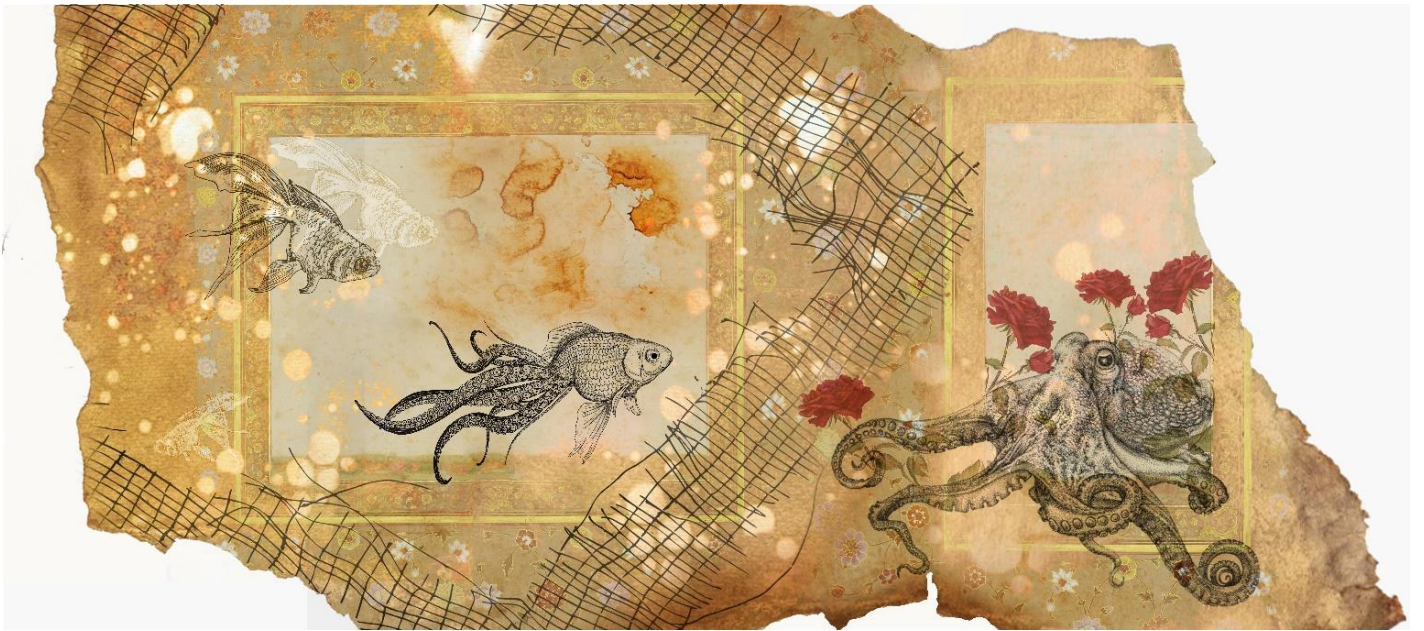
Evolve | Mixed Medium with printmaking | 7 x 16 Inches