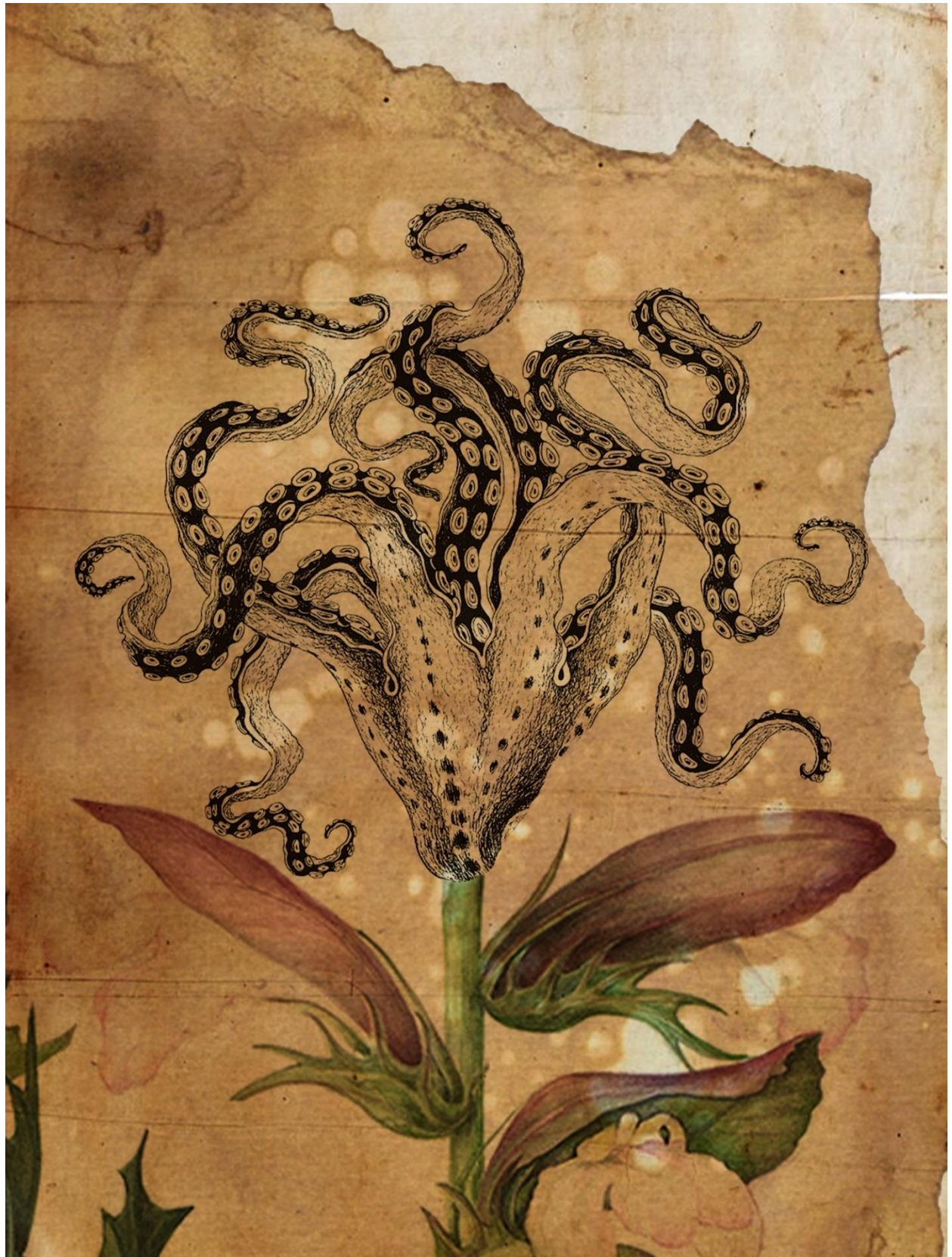
Evolve If I Must | Mixed Medium with printmaking | 13 x 18 Inches