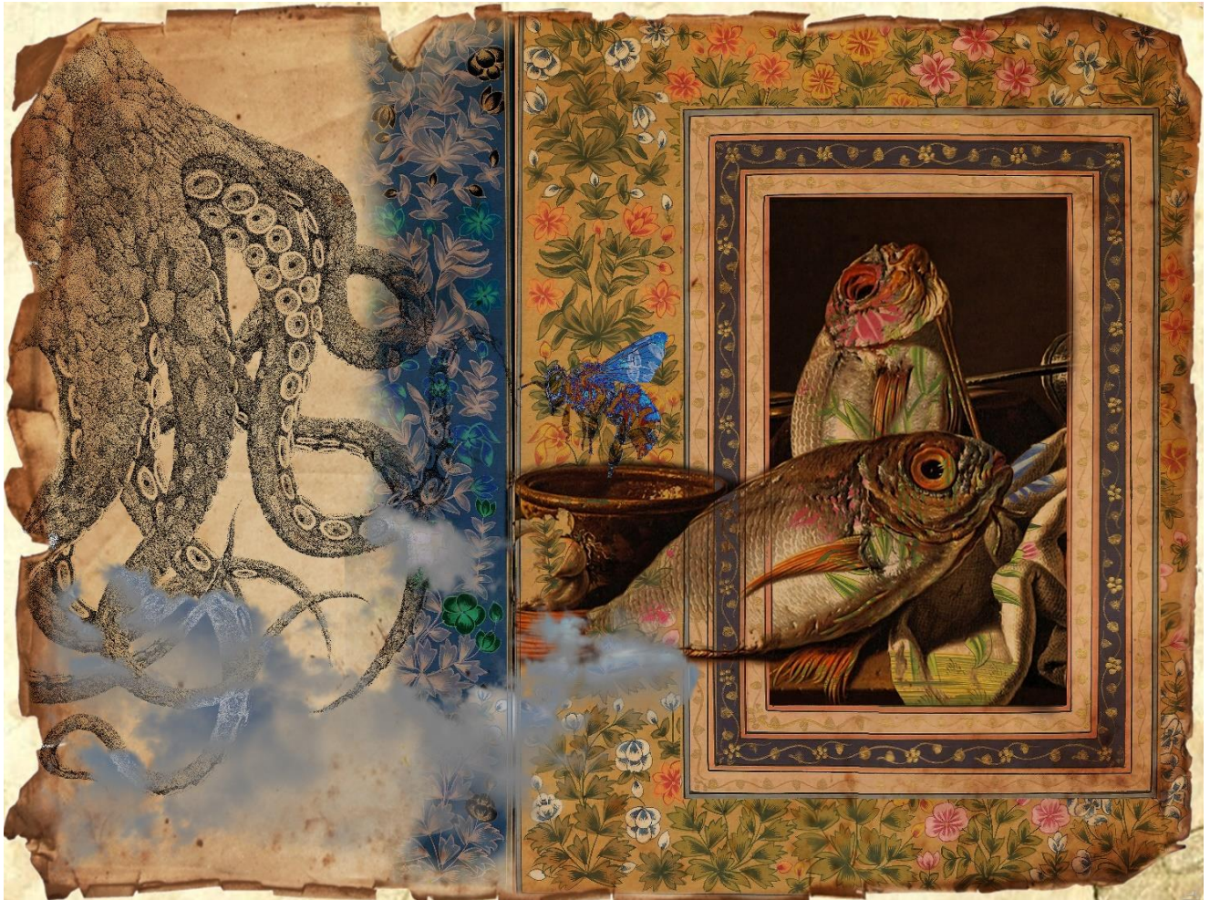
Disintegration Of Memory | Mixed Medium with printmaking | 10 x 8 Inches