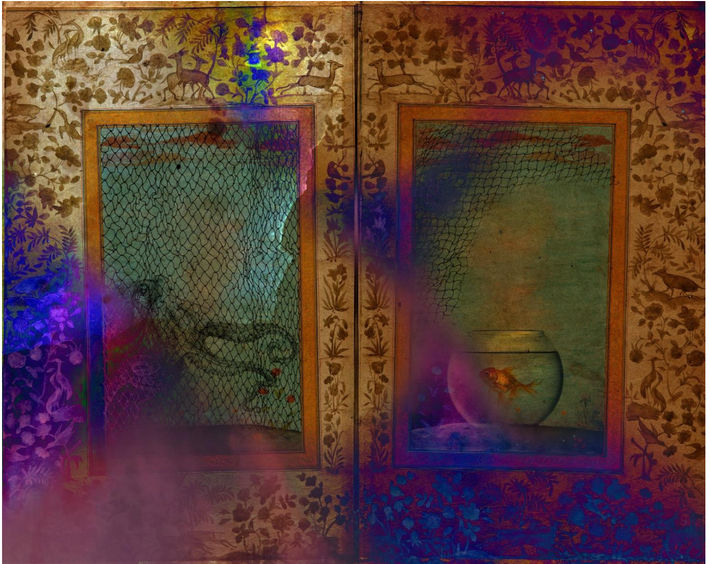
Within The Fish Bowl | Mixed Medium with printmaking | 47 x 37 Inches