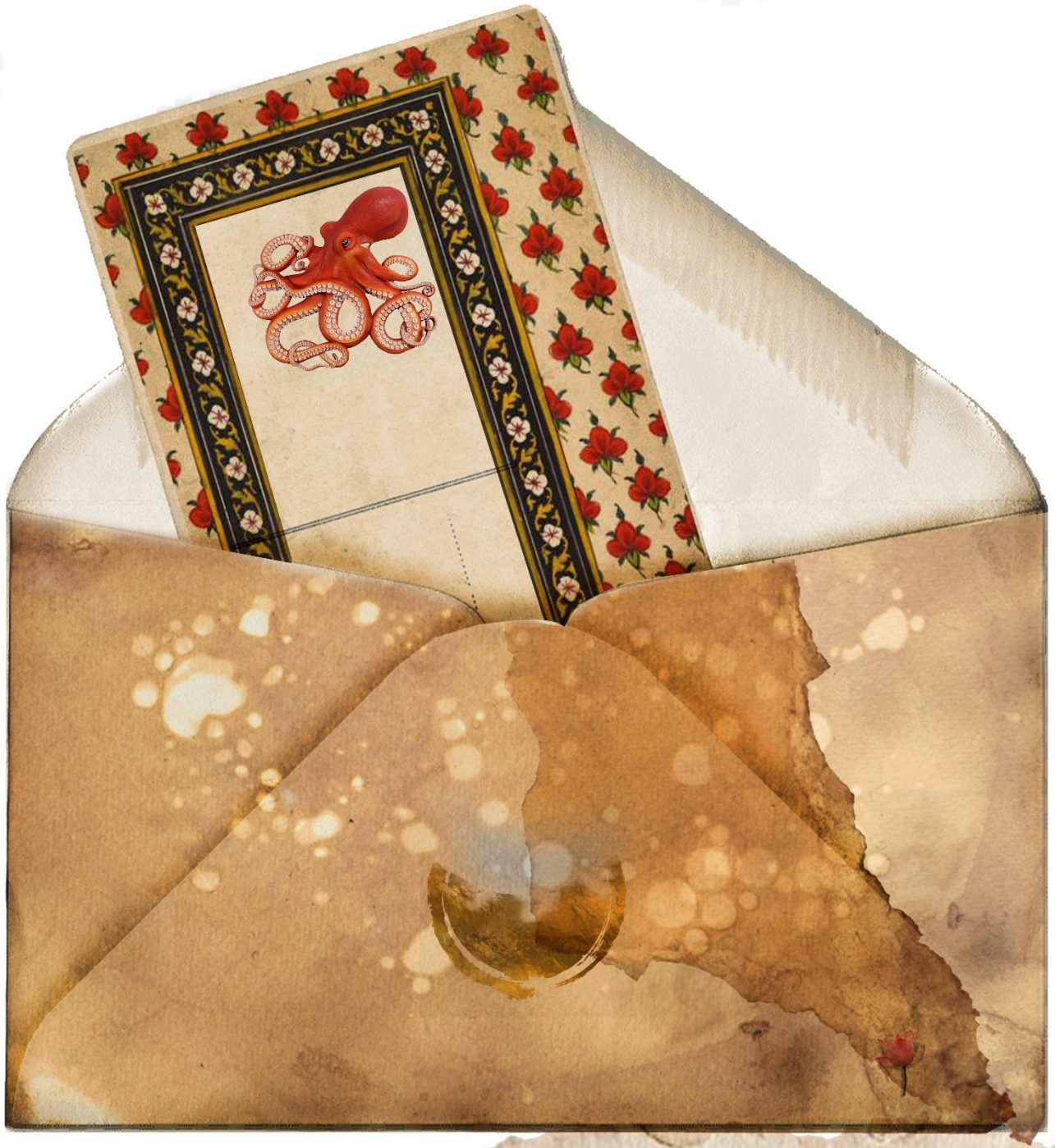
Invite | Mixed Medium with printmaking | 7 x 7 Inches