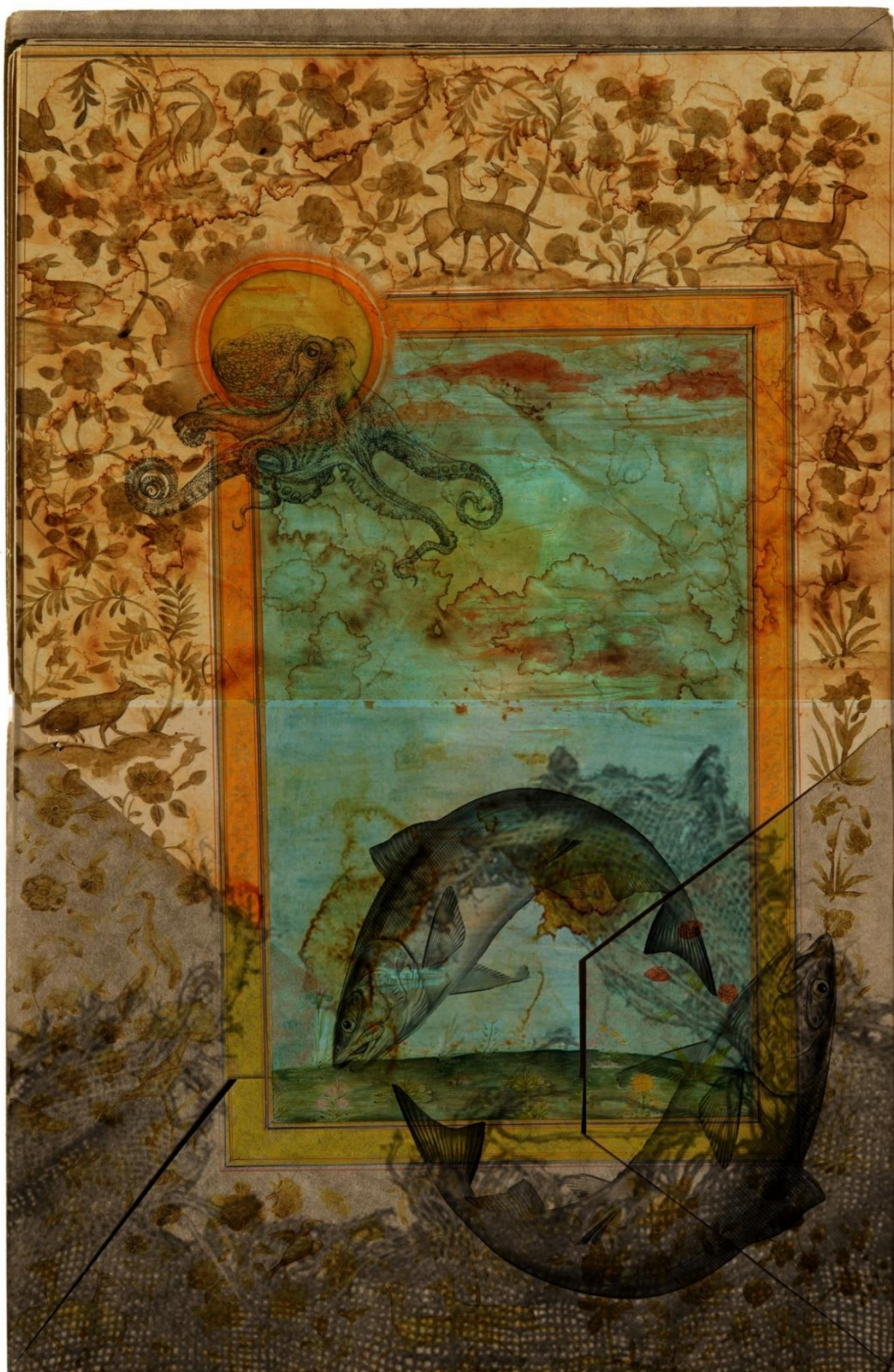
I Am My Own Royalty | Mixed Medium with printmaking | 24 x 16 Inches