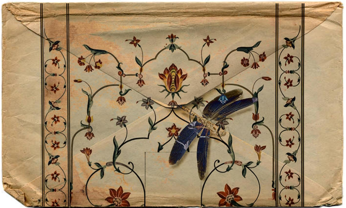
Invite Two | Mixed Medium with printmaking | 11 x 7 Inches