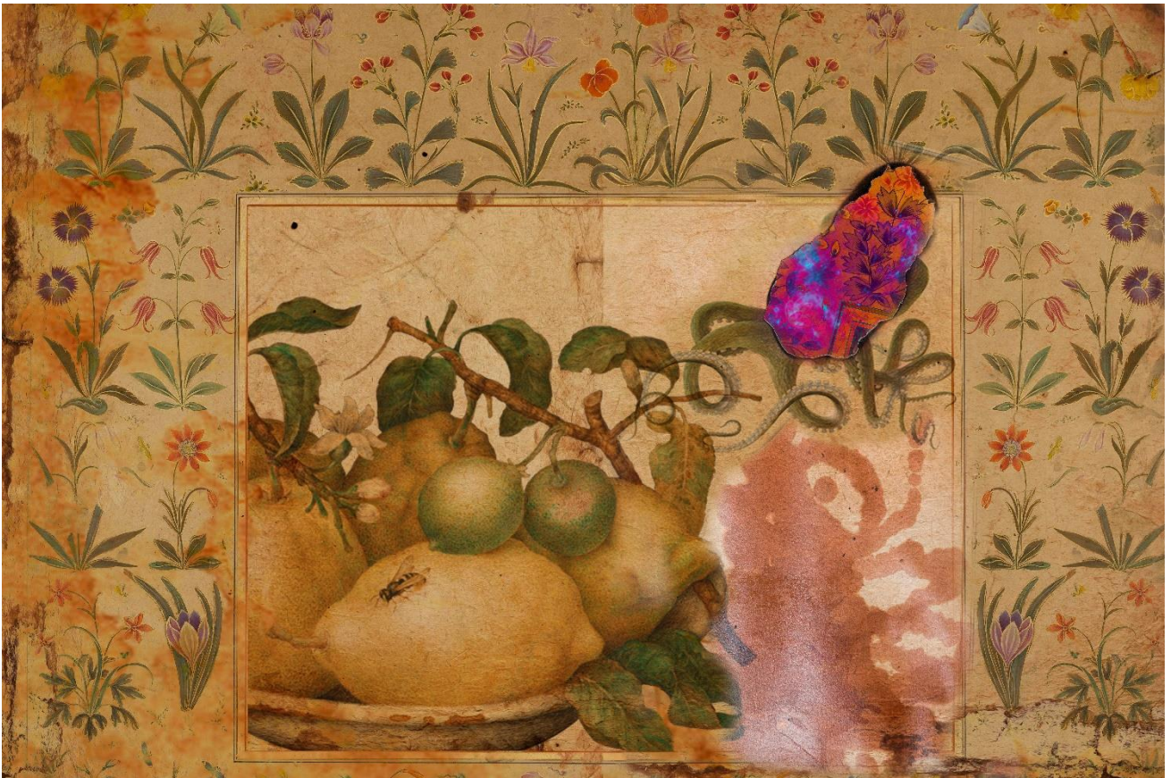
A New Window | Mixed Medium with printmaking | 36 x 24 Inches