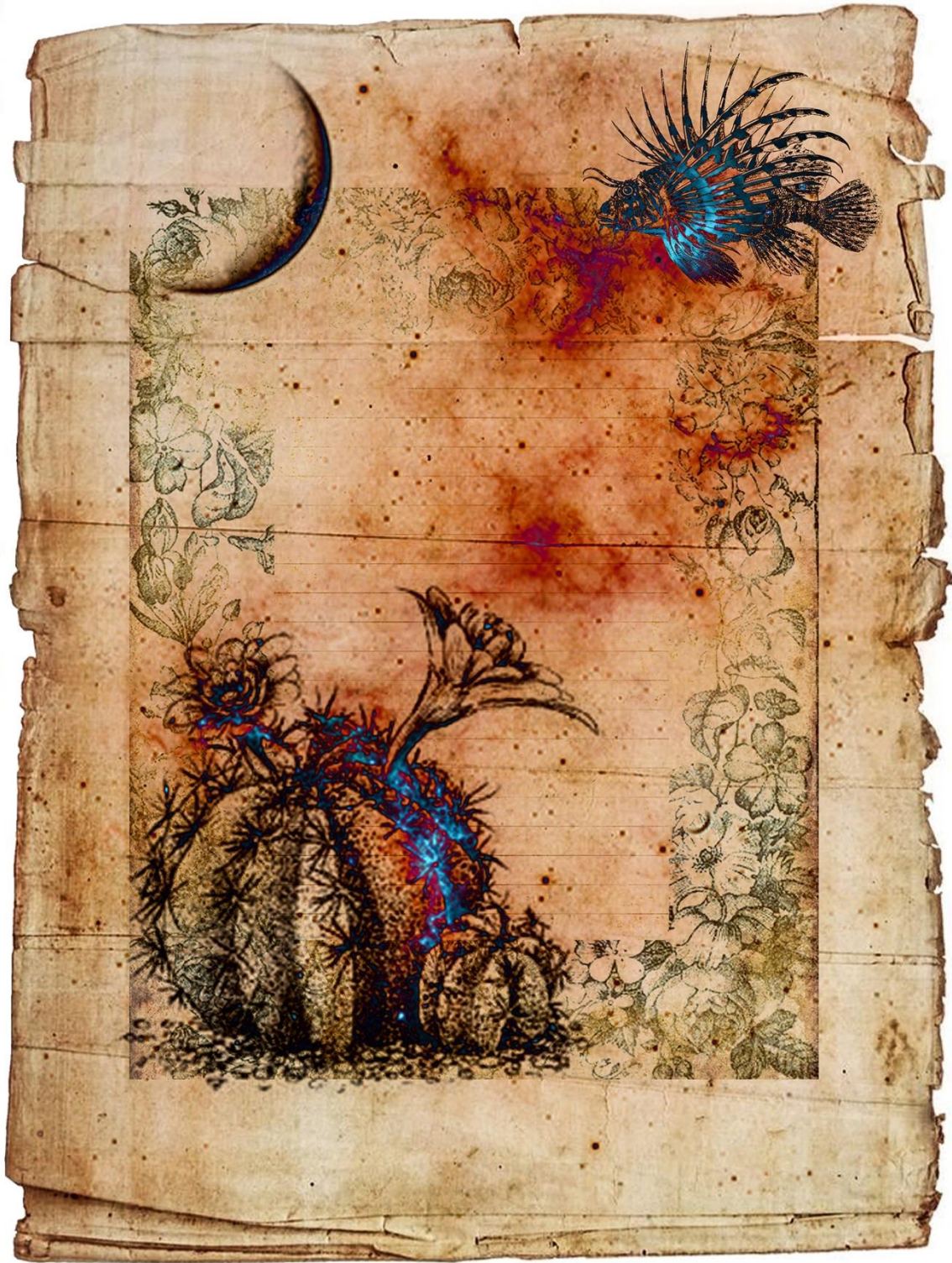
Sting With A Glow | Mixed Medium with printmaking | 22 x 16 Inches