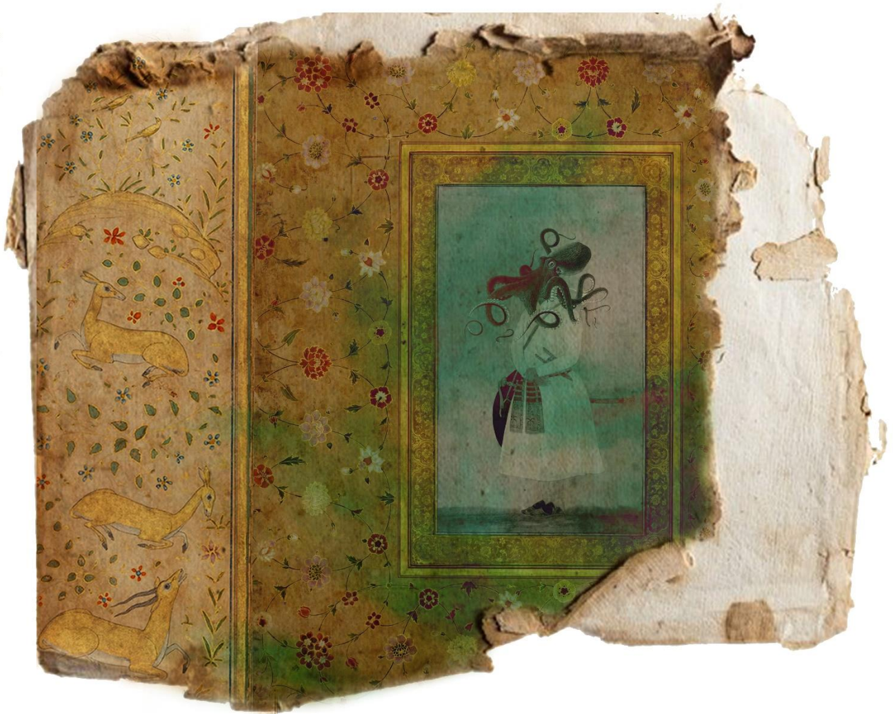
Untitled | Mixed Medium with printmaking | 16 x 15 Inches