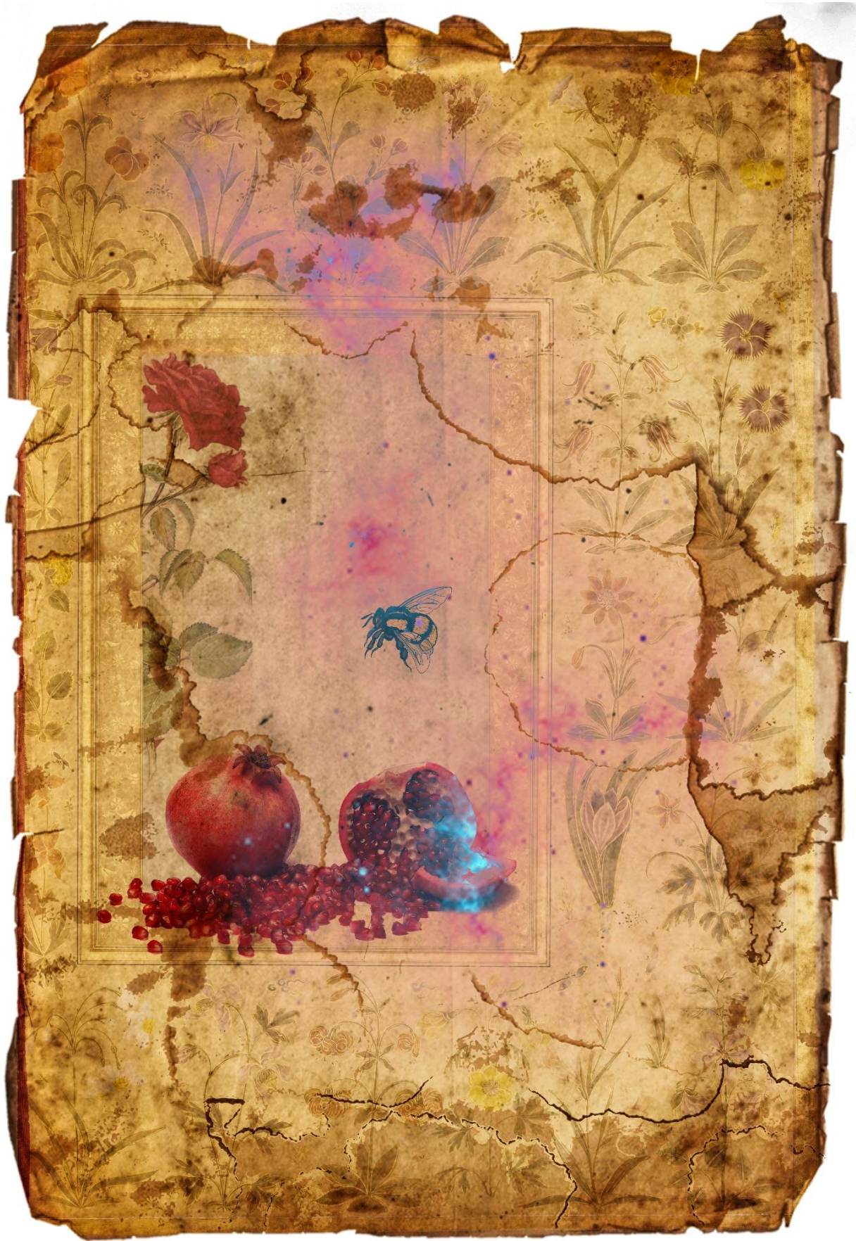
That Glow From With In | Mixed Medium with printmaking | 23.5 x 16 Inches