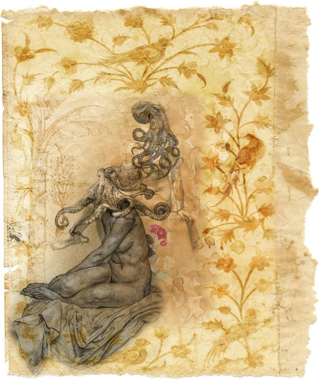
Awaited | Mixed Medium with printmaking | 23 x 20 Inches