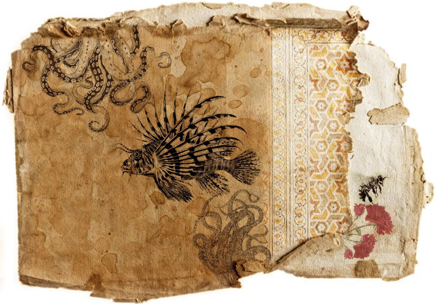
Stingers | Mixed Medium with printmaking | 10 x 7 Inches