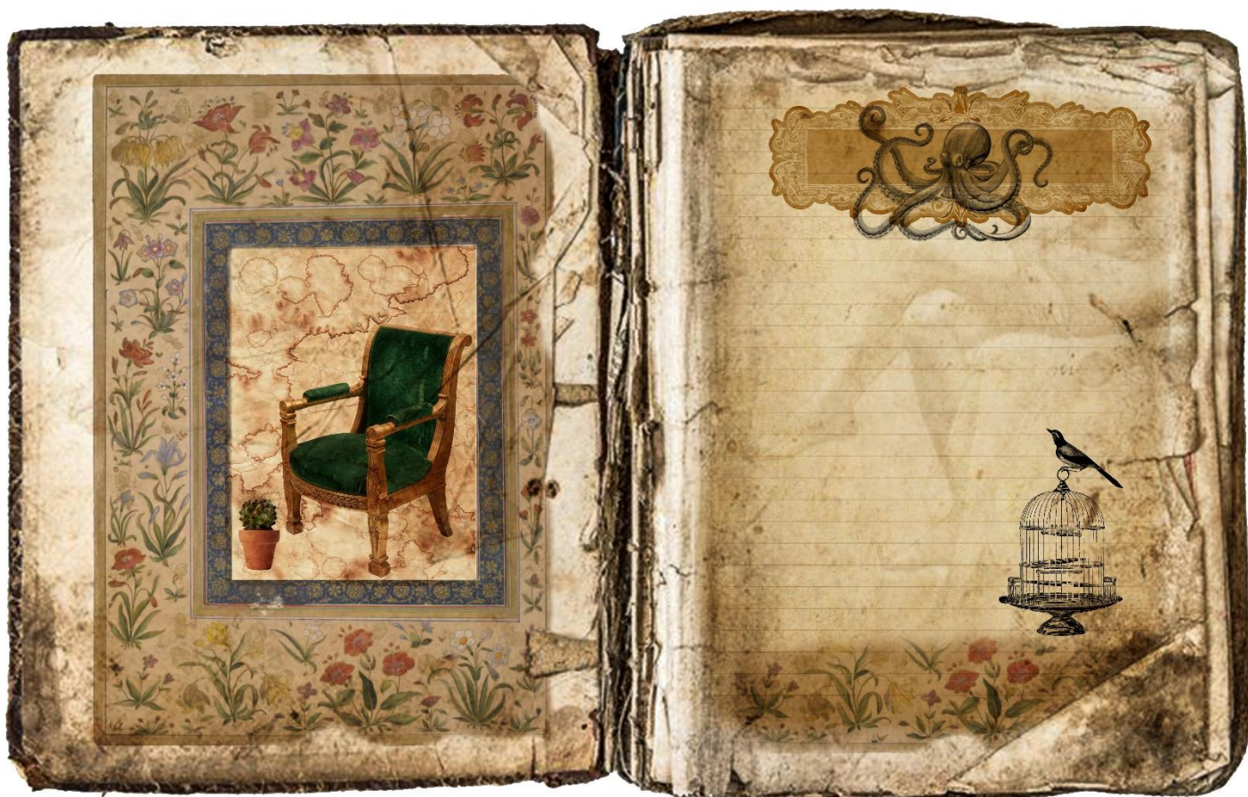
Mocking Who | Mixed Medium with printmaking | 19 x 12 Inches