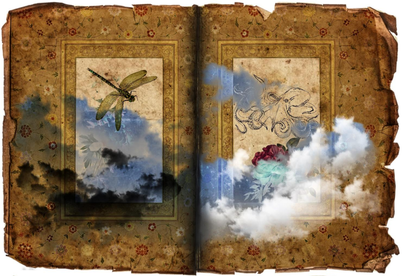
A Journey | Mixed Medium with printmaking | 31.5 x 22 Inches