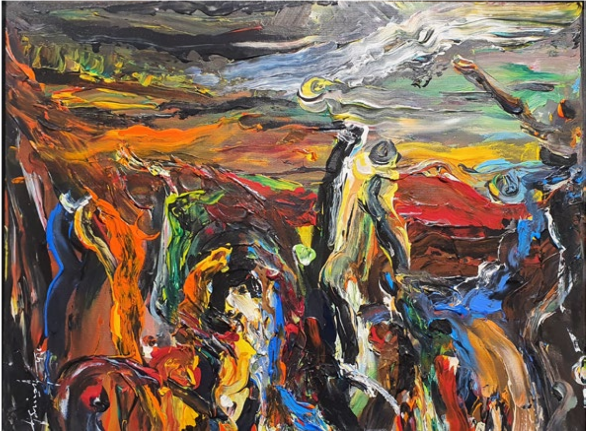
Untitled | Mixed Media on Canvas | 37.5 x 31.2 inches