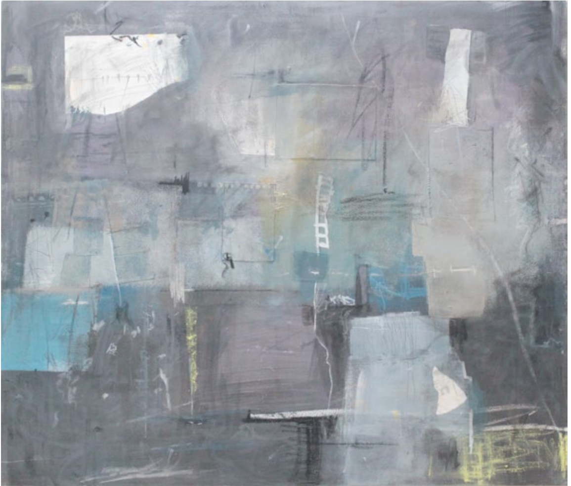
Not Even Gaming | Mixed Media on Canvas | 42 x 36 inches