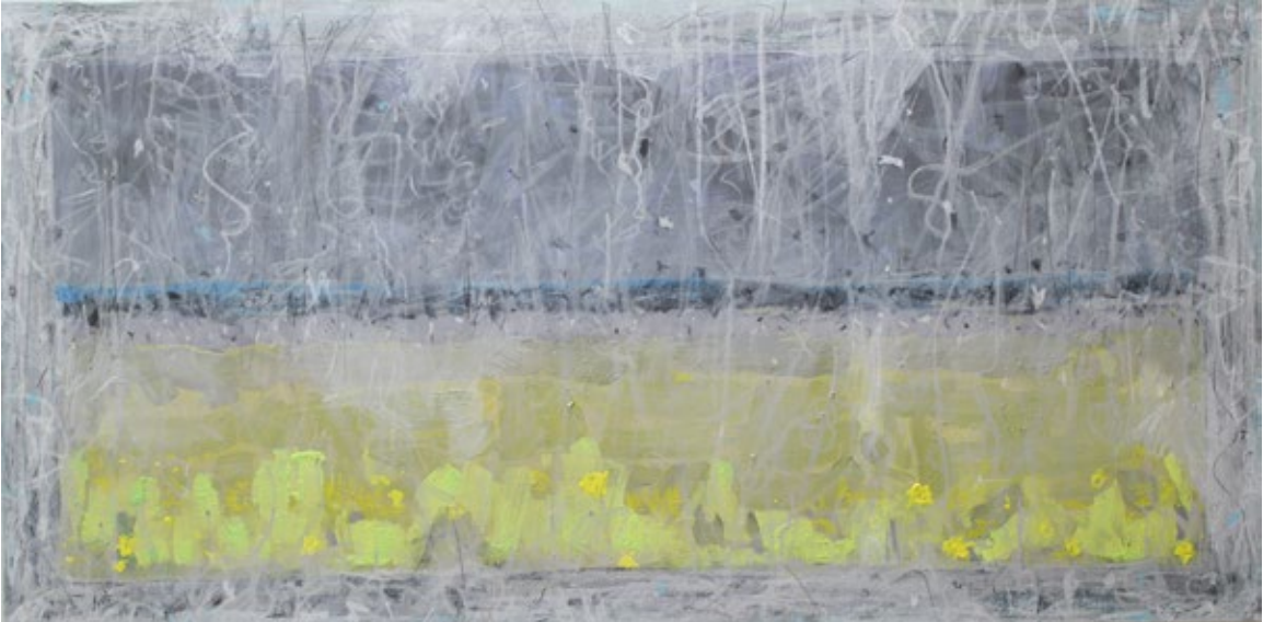
Wires | Mixed Media on Canvas | 48 x 24 x 0.7 inches