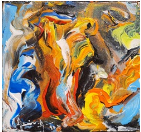
Untitled (3 painting series) | Mixed Media on Canvas | 20 x 20