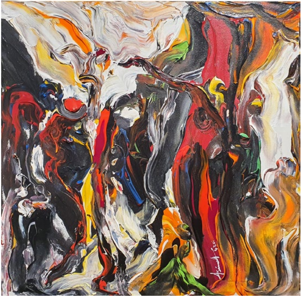
Untitled | Mixed Media on Canvas | 33 x 33 inches