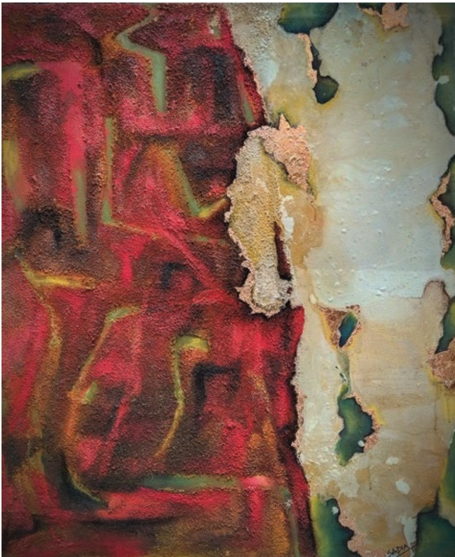
Khud Kalami - 01 | Mixed Media on Canvas | 54 x 48 inches