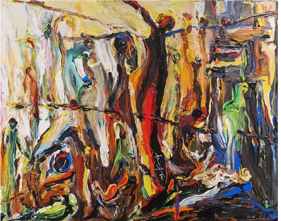
Untitled | Mixed Media on Canvas | 44.3 x 38.8 inches