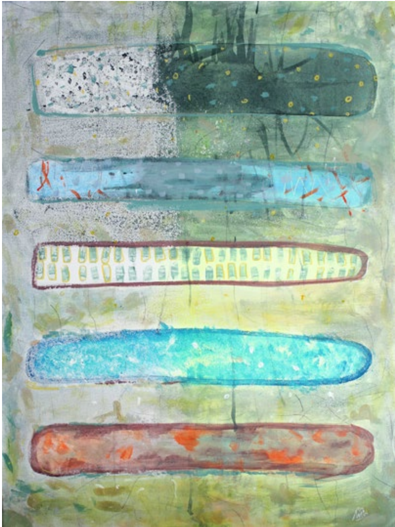
Elements of Design | Mixed Media on Canvas | 32 x 24 x 2.5 inches