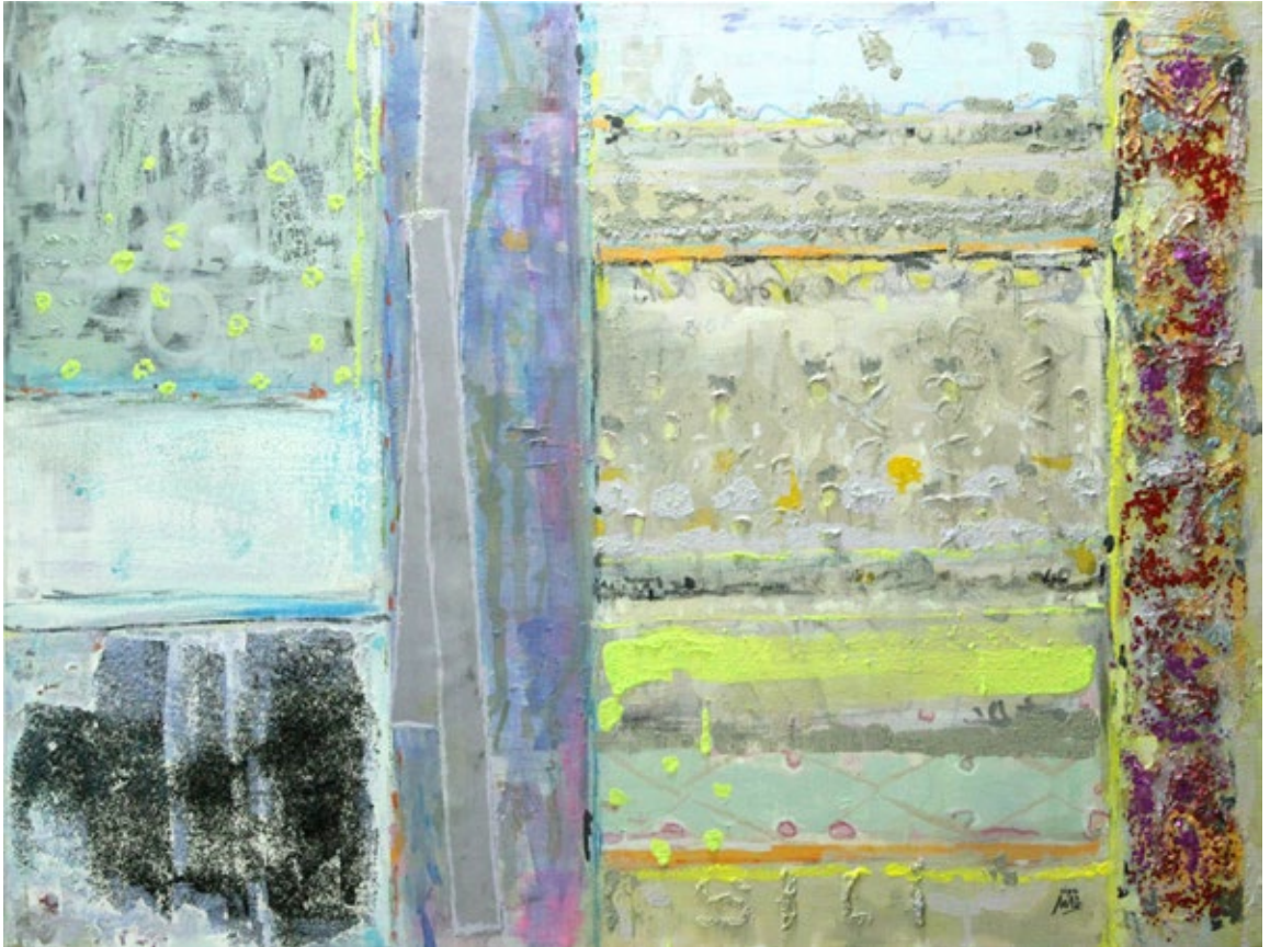
Purple Outline | Mixed Media on Canvas | 32 x 24 x 1.5 inches