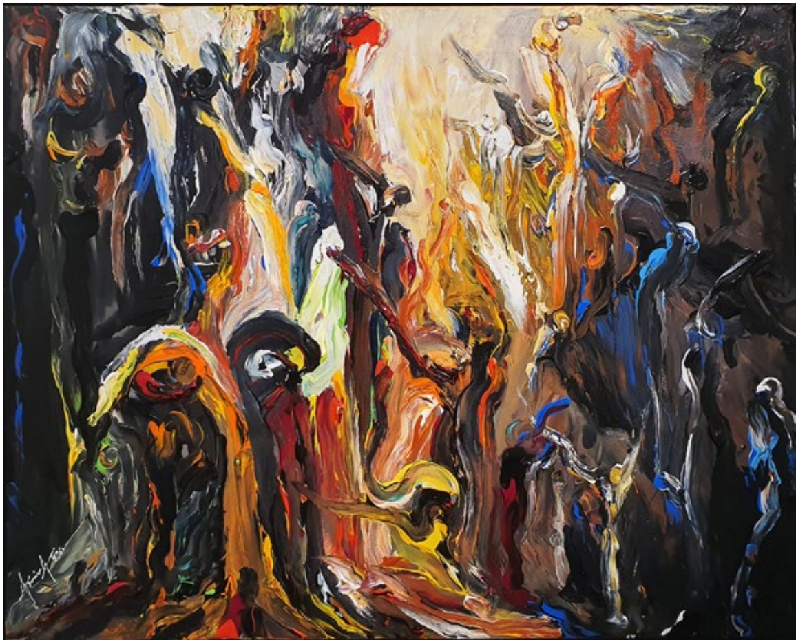
Untitled | Mixed Media on Canvas | 44 x 38.9 inches