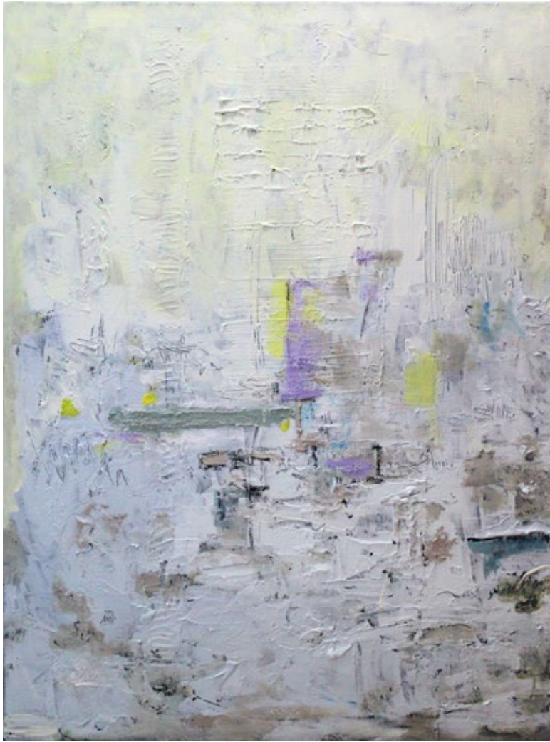
Joy in Light | Mixed Media on Canvas | 31.5 x 24 inches