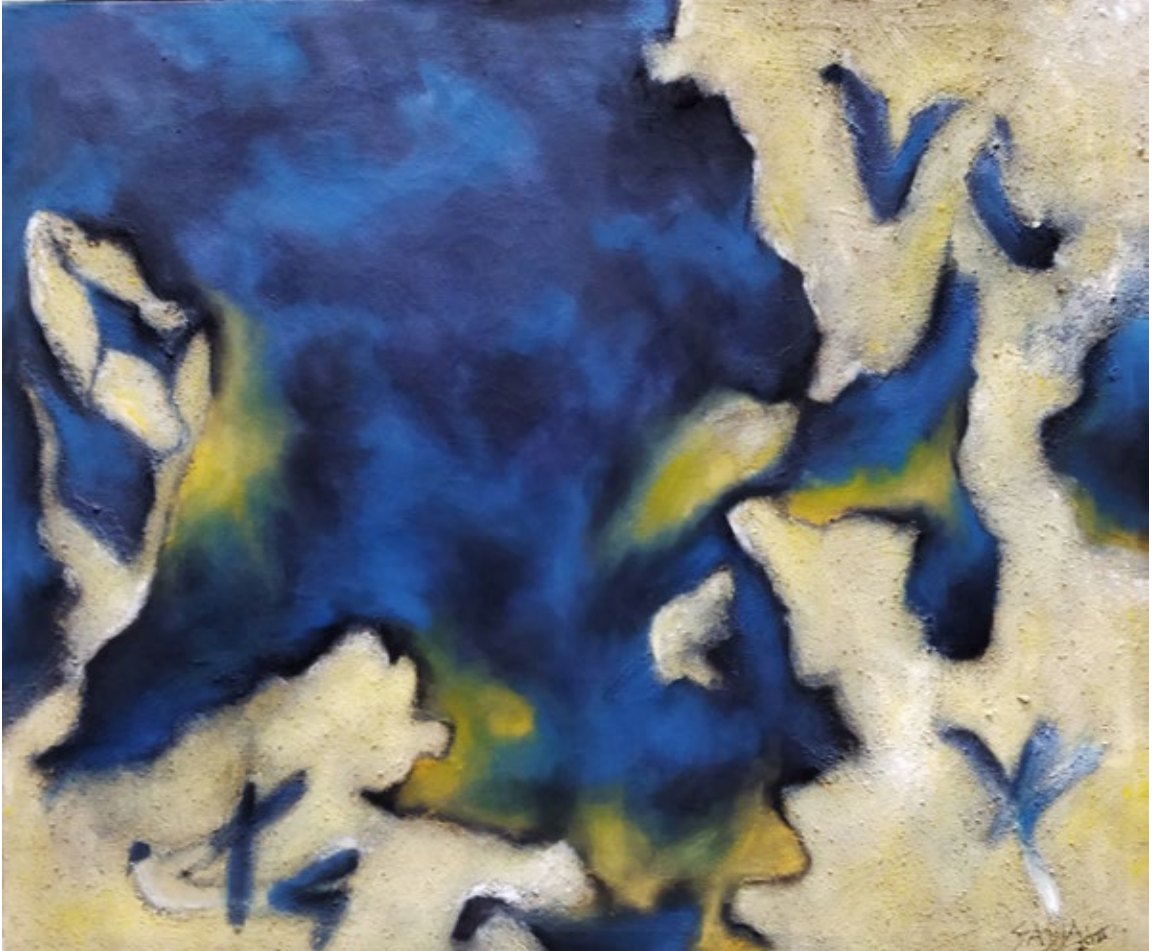
Khud Kalami - 01 | Mixed Media on Canvas | 43 x 52 inches