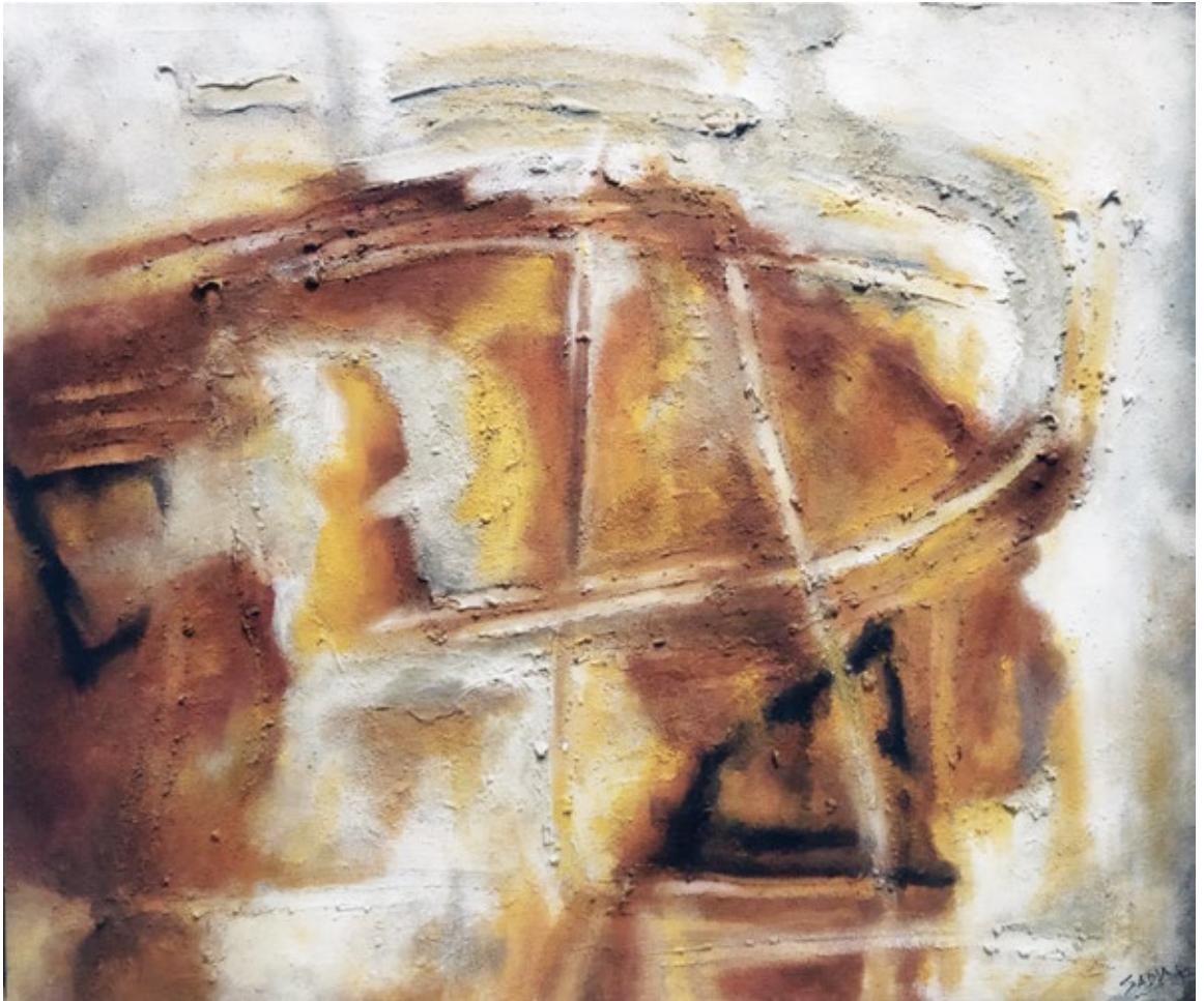
Writing In The Sand | Mixed Media on Canvas | 50 x 38 inches