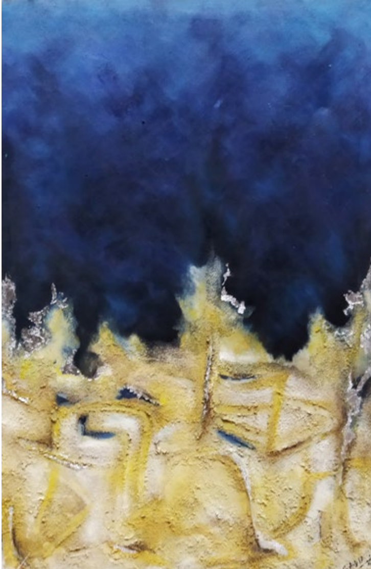
By the Sea Shore - 01 | Mixed Media on Canvas | 50 x 38 inches