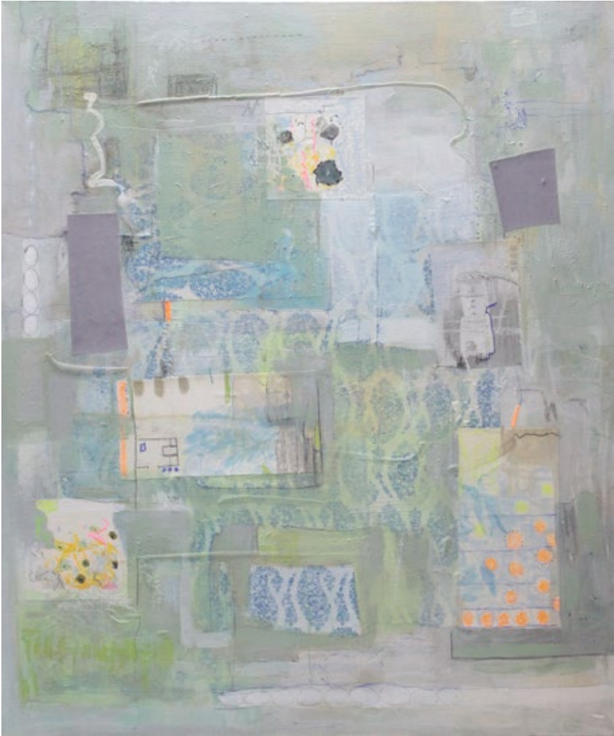
Garden | Mixed Media on Canvas | 30 x 36 inches