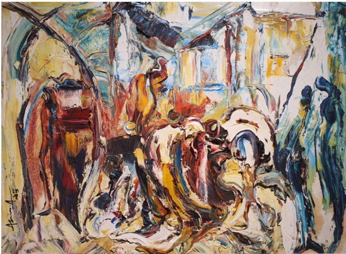
Untitled | Mixed Media on Canvas | 33 x 33 inches