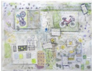
Nature on Trial